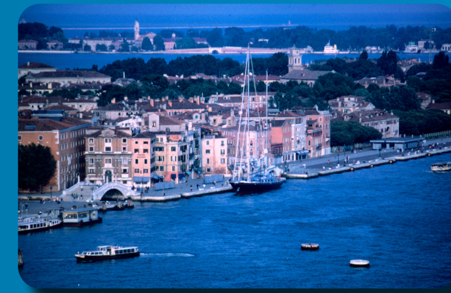
The image taken on Agfacolor negative, 1990

UK postage and disc or USB drive included in the prices.