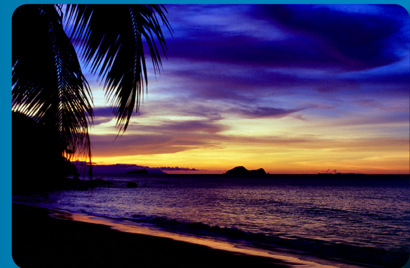
Taken from 35mm Fuji Velvia slide

I have a guide at the end of this brochure showing you how to view the slides on a TV by USB. There are also links to home or cloud streaming options.