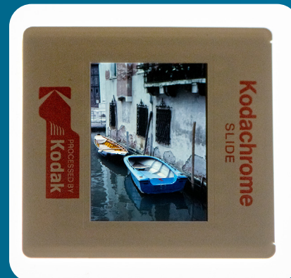
35mm Kodachrome slide

I scan mounted or unmounted 35mm slides. I do scan glass mounted slides however these are only done as a bespoke price due to the variations in condition and transport of the glass.