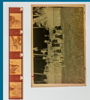
110 and 127 film negatives

We can negatives up to 8 x 8 in size. All large format packages include large Tif for storing, smaller 4K JPG files for viewing and return postage.