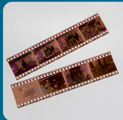
35mm negative strip

Scanning 35mm negatives and smaller needs a high-density scanner. With sizes like 110 film negatives I raise the density as the originals are considerably smaller.